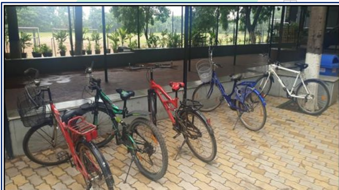
Bicycles Parking Lot