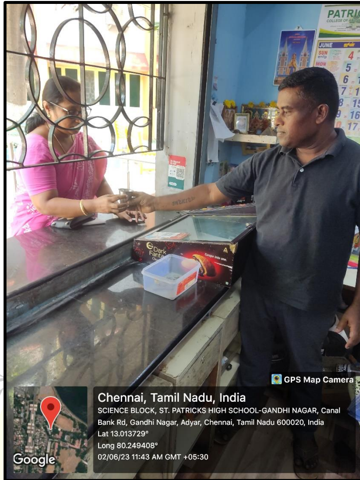
Tea served in steel cups